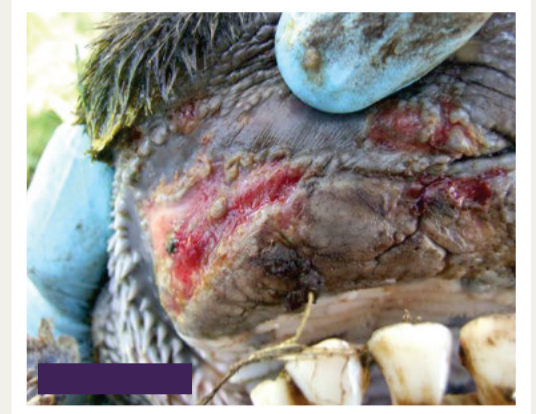
Mouth sore where a blister has burst.