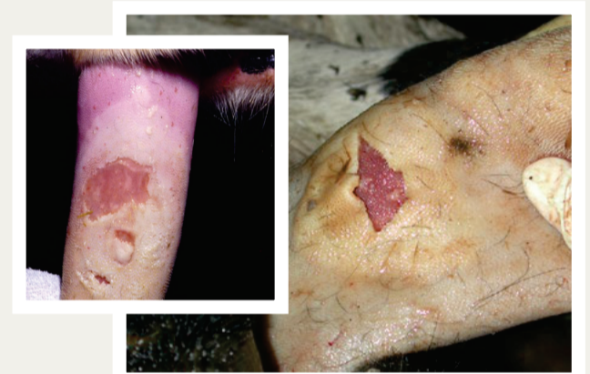
Blisters on tongue with yellow-tan edges.