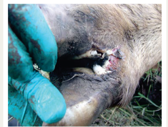
Lesion in the hoof of a cow