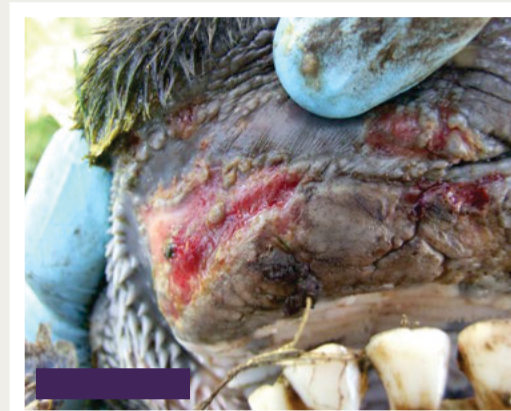
Isilonda somlomo apho kugqabuke ithumba.