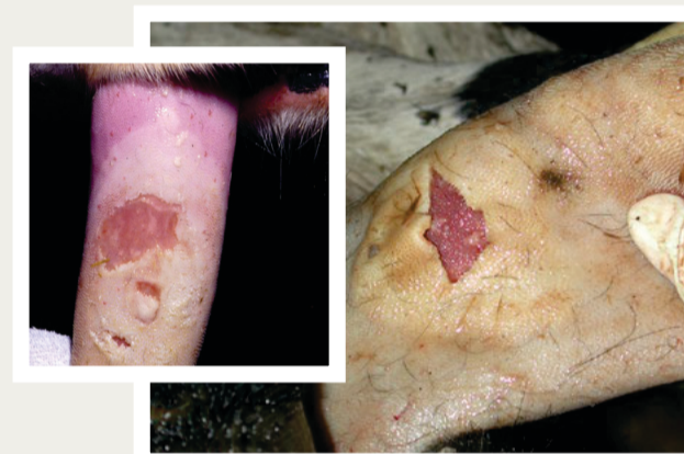
Amaqhakva elwimini anempawu ezimthubi ngebala.