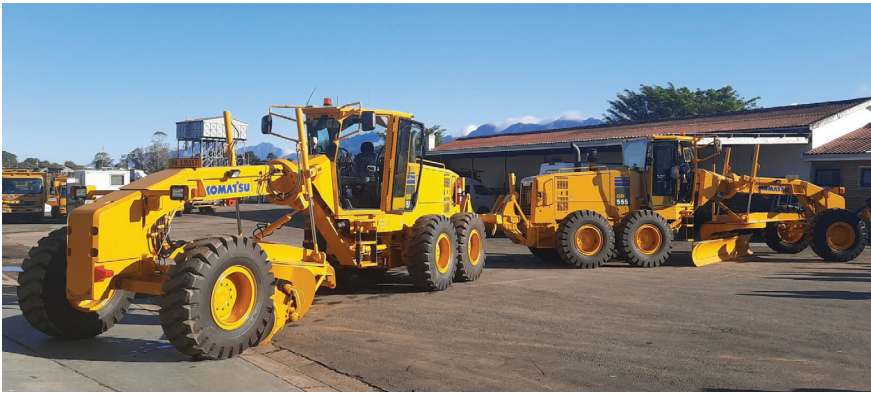
With nearly 10 million machines under the capable hands of Roads Workers, the GRDM ensures seamless maintenance and utilisation of these vital resources to service the expansive 47,000km² network of provincial roads in the picturesque Garden Route.

This year to date the GRDM received three graders from Western Cape Government. The last two additions are already being utilised by two (2) maintenance teams serving roads on the outskirts of George. The first machine was delivered on 14 June 2022 and later in 2022 the team took the brand new graders into acceptance.