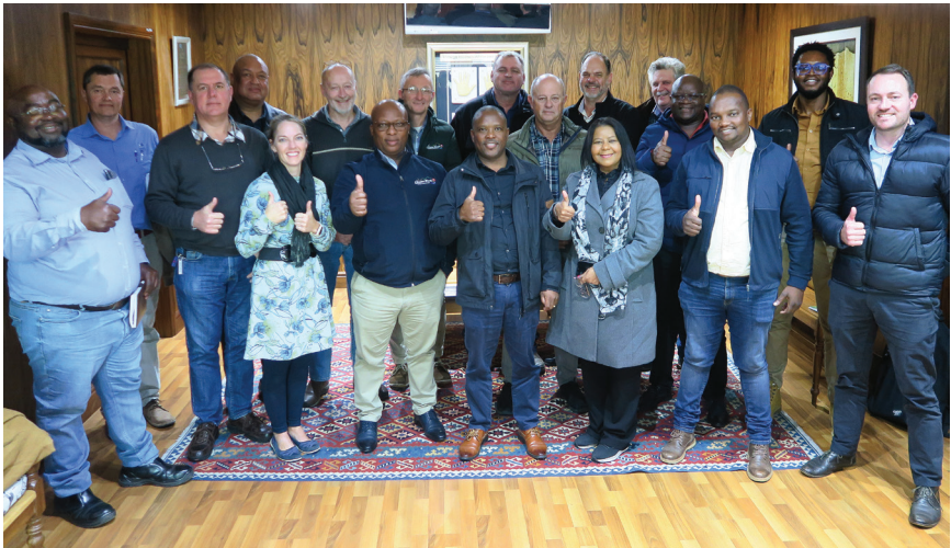
Representatives from the Tefla Group (Pty) Ltd who will be responsible for constructing the regional waste management facility met GRDM on 14 June 2023 to officially agree on the commencement of the construction of the facility.

A Construction Work Permit was issued on 8 June 2023 by the Department of Employment and Labour for the Regional Waste Management Facility. This means that the contractor, known as Tefla Group (Pty) Ltd, will commence their works in June/July 2023. This is a huge milestone for GRDM because through its previous Public Private Partnership approach, the partner pulled out during the Covid-19 pandemic. The current landfill site, owned by PetroSA is running out of capacity, while it is still in use by Bitou, Knysna, George and Mossel Bay Municipalities, but won’t be available after February 2024 for waste disposal.