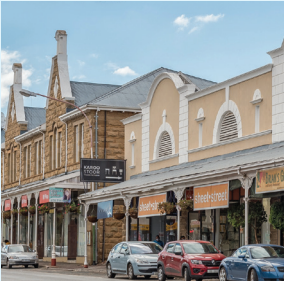
A street scene with businesses, people and vehicles in Oudtshoorn, the town with the cleanest air in the whole of Africa.

The efforts invested over the past decade to enhance the air quality in Oudtshoorn have paid off, as it was historically one of the most polluted towns in the Garden Route district.