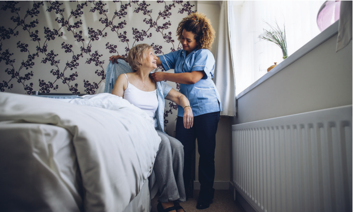
Home-based care training to 140 unemployed Garden Routers is rolled out through the Garden Route Skills Mecca initiative.

GRDM was awarded more than R 5.2 million for training of 140 unemployed persons as Personal Care Assistants across the Garden Route district, including seven (7) B-municipalities.