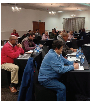
The workshop was attended by Local, Provincial and National Government representatives.

A successful Human Settlements Accreditation Workshop was recently hosted GRDM. It was attended by Human Settlements representatives, mayors and politicians, as well as stakeholders from the National Department of Human Settlements and the Western Cape Department of Infrastructure.