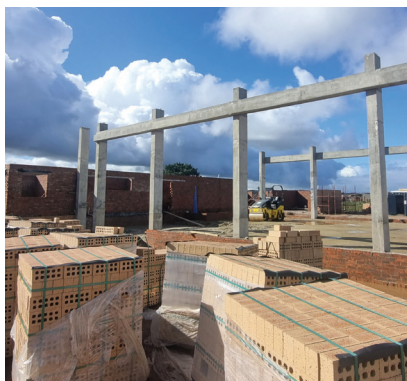
Progress of the construction in June 2023.

The GRDM fire station is being constructed in strict adherence to the National Regulations and Standards governing such facilities.