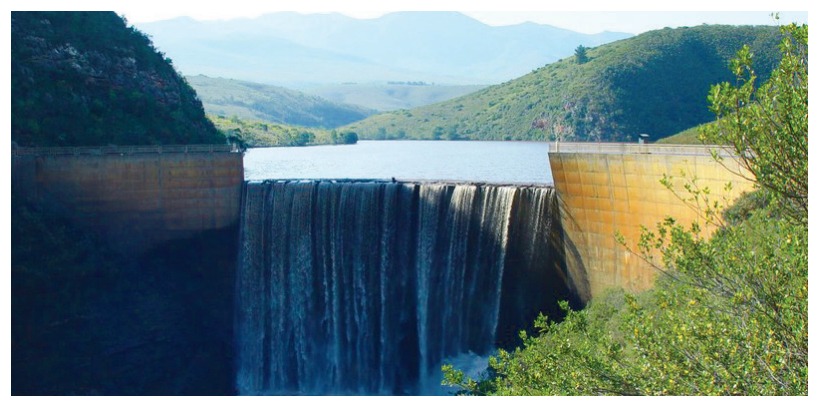
Duiwenhoks Catchment area, located in Western Cape, South Africa, drains the Langeberg Mountains and flows south to the coast, entering the sea west of Mossel Bay in the Southern Cape. The river is approximately 83 km long with a catchment area of 1 340 km².

The objective is clear: "To make sure that the region is water secure and hence benefit from the spin-offs thereof."