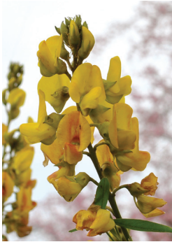
The name ‘honeybush’ is derived from the sweet, honey-like scent of the plant when in full bloom with its yellow flowers.

“The project aims to provide one processing facility located on the Nooitgedagt Farm (Oudtshoorn) property which is owned by the GRDM.”