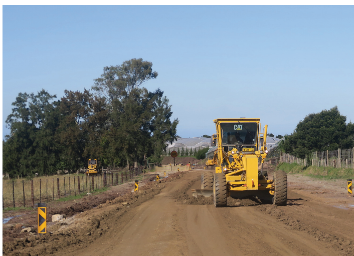
'n Padskraper besig op die DR1618, 'n projek wat deur die Wes-Kaapse Regering (WKR) befonds en die Tuinroete Distriksmunisipaliteit bestuur word.

Die Gwaiingweg (DR1618) projek, met 'n begroting van R67 miljoen, vorder goed en sal na verwagting teen Junie 2024 voltooi wees.