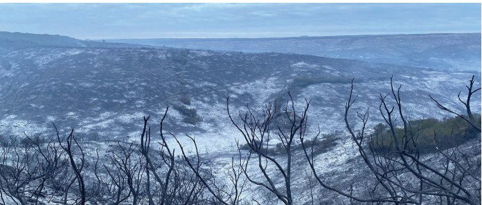
The after-effects of a wildfire that ravaged through Spuihoek in the Hessequa Region during November 2022.

Comparatively, although the previous year saw three additional wildfires between July 2021 and June 2022, the extent of the damage was slightly lower, with approximately 14,500 hectares consumed.