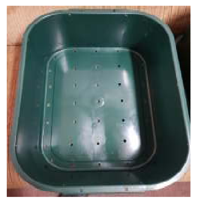
Figure 2: Top layer with drainage and ventilation holes