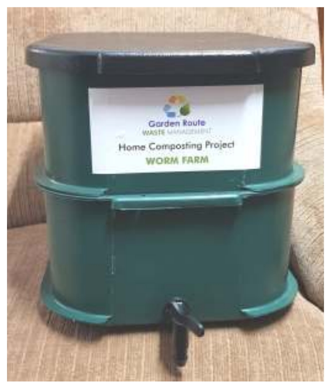
Figure 1: Assembled worm farm with black plastic lid