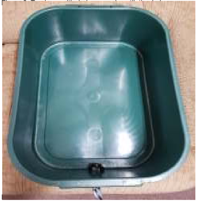
Figure 3: Bottom layer fitted with tap