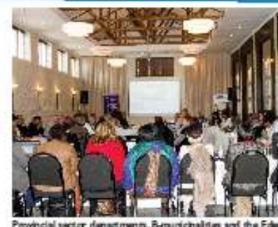
Provincial sector departments, B-municipalities and the Eden District Municipality gethered at the 4 day joint Planning Initiative in Mossel Bay.